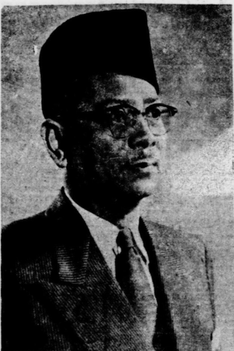
Tunku Abdul Rahman, Prime Minister of the Federation of Malaya, which became independent at midnight yesterday.